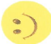
table or pair voices